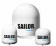
INMARSAT FLEETBROADBAND RANGE