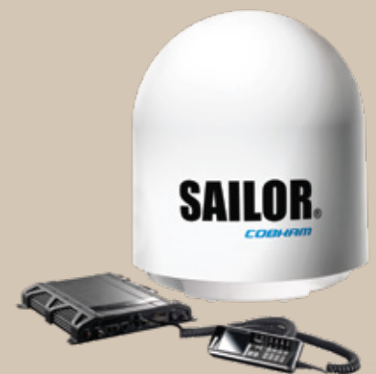
L-BAND BACK UP