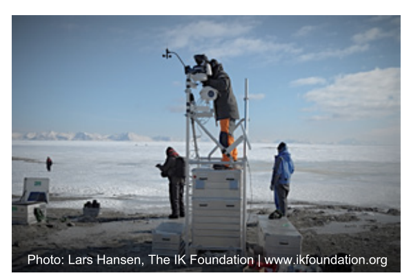
Initial set-up of the Field Station in May 2019

In order to achieve reliable connectivity for long periods of time without human intervention, The IK Foundation approached IEC Telecom, an Iridium partner and service provider, who recommended a Thales MissionLINK terminal powered by Iridium Certus. The Thales MissionLINK terminal was chosen for its streamlined interface and ease of installation and operation.